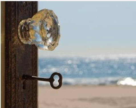
Huronia Alarm & Fire Security Inc. Vacation Safety Tips