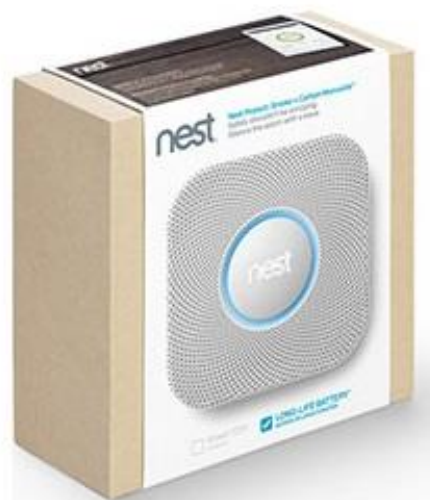
NEST Protect, now available at Huronia Alarm & Fire Security Inc.

Give us call today to talk about how we can bring NEST Protect into your home.